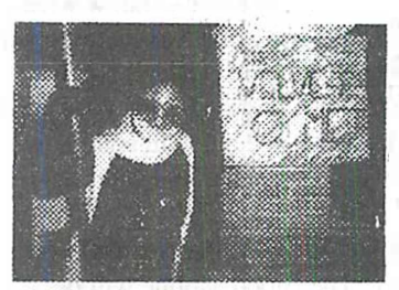
Welcome to the Velvet Comet!

Well, we took that as a challenge and created the Alien Casino, which is being copied by conventions all over the country.